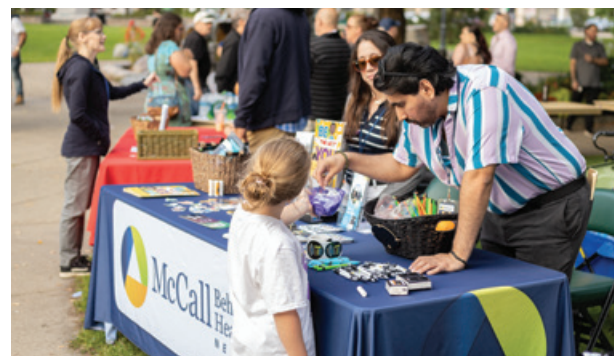
McCall's Prevention team making community connections.

21 YOUNG CHILDREN SUPPORTED— Providing early intervention through ECCP services