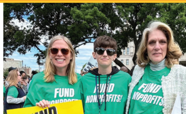
Members of CLEAR attend the nonprofit rally at the Capitol.

150 CONNECTIONS TO TREATMENT— Facilitating access to life-saving care and recovery pathways