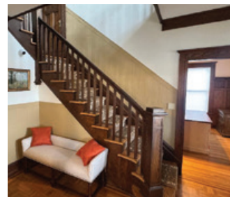
The restored staircase and woodwork.