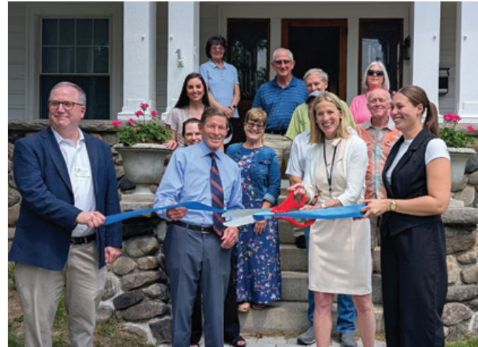
Local leaders, staff, board members and US Senator Richard Blumenthal attend the Hanson House ribbon-cutting ceremony.

Hanson House represents more than renovation—it reflects our unwavering belief that healing begins with a safe place to call home.