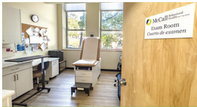
McCall's Primary Care exam room.

199 CLIENTS ACCESSED PRIMARY CARE— Supporting whole-person wellness through integrated health services