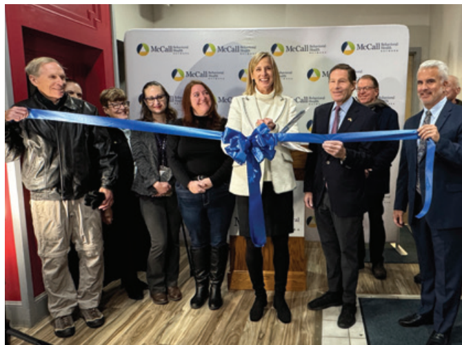
McCall's CEO, board members, and staff join local leaders and The Cigna Group Foundation to celebrate the grand opening.

Every milestone achieved this year was made possible through the dedication of staff, the partnership of community leaders, and the generosity of donors who share our belief that healing should be compassionate, coordinated, and accessible to all. McCall's Whole Health Center stands as a testament to what is possible when a community comes together to care for the whole person.