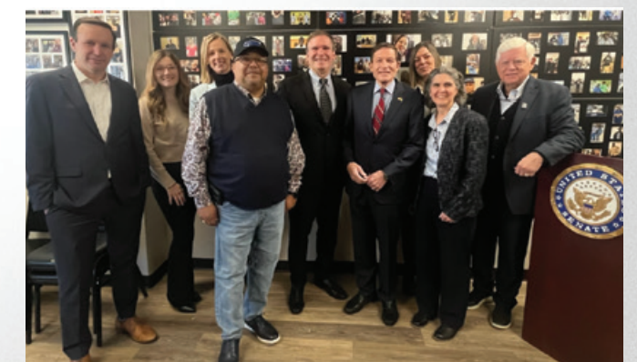
McCall staff attend press conference in support of federal funding.

With leadership from US Senators Chris Murphy and Richard Blumenthal, this initiative strengthens public health and public safety across western Connecticut.