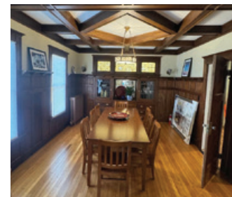
The renovated dining room.