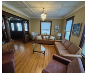
The renovated living room.