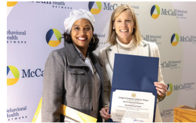
US Congresswoman Jahana Hayes presents McCall's CEO with a Special Congressional Recognition Award.

“Treating physical health, mental health, substance use, and social determinants of health all at once can change the trajectory of a person’s life.”