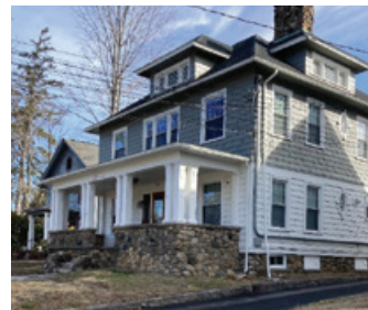
The new Hanson House in Torrington.