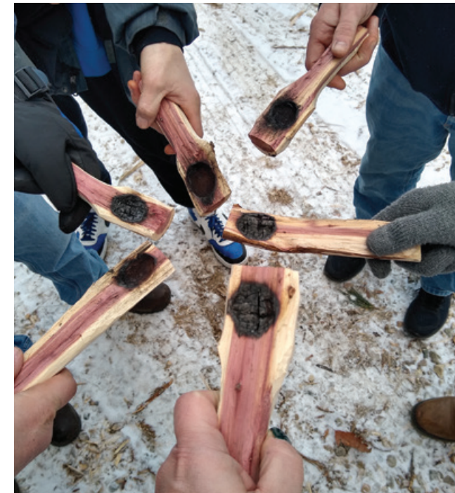
Residential clients enjoy an outing with Adventure Recovery.

1,775 ADULTS SUPPORTED— Creating safe spaces for adults to heal and pursue lasting wellness