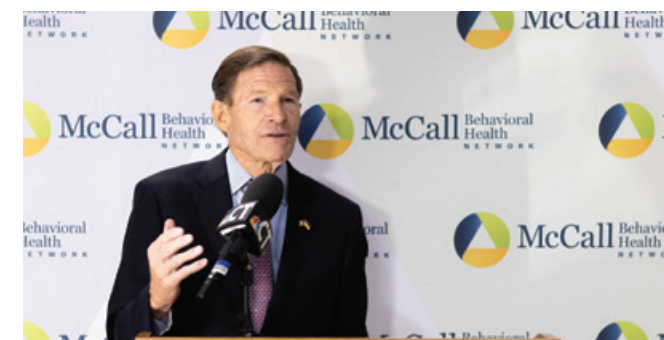
US Senator Richard Blumenthal shows his support.